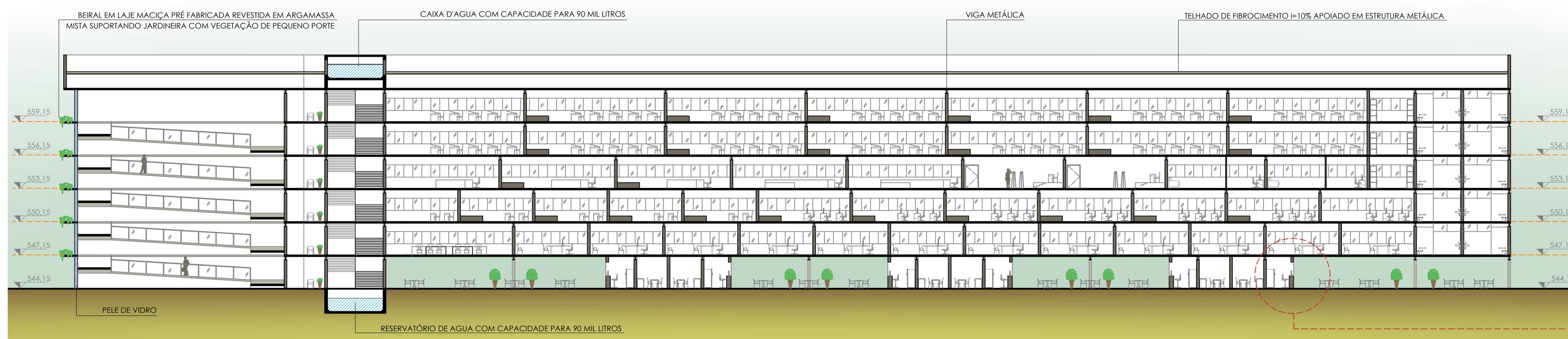
CORTE C ESC 1:250